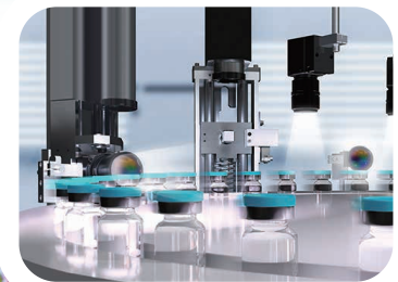
^ Auto Optical Inspection