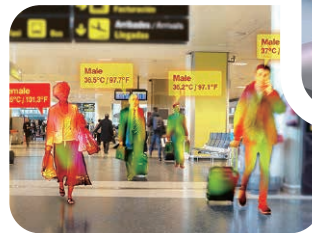
^ Public Safety